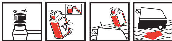
1. REMOVE CAP 2. SQUEEZE 3. POUR 4. CLEAN