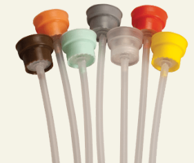
ONE GALLON BOTTLE INSERTS Inserts available for one gallon bottles • Are color coded for easy use and proper selection