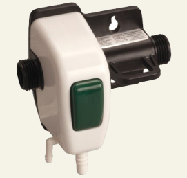
SINGLE WALL MOUNT DISPENSER F699198 Accurately dilutes and dispenses concentrated chemicals • For mop buckets or auto-scrubbers • 3.5 GPM flow-rate • Not for use with Trumix chemicals.