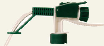
MOBILE DISPENSER F698098 Attach to standard hose • Portable • Fills into mop bucket/spray bottle/auto-scrubber • 2gpm flow-rate