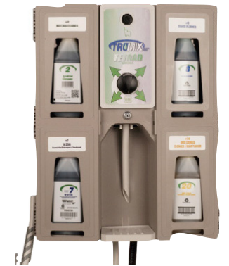
TETRAD DISPENSER F696498 Four-product solution dispenser • Dilution accuracy and cost controls are simplified