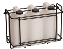
HALF-GALLON F-STYLE RACKS LOCKING Available with three or six bottle configuration.