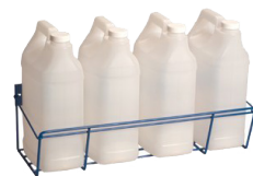
GALLON F-STYLE RACKS NON-LOCKING Available with one or four bottle configuration.