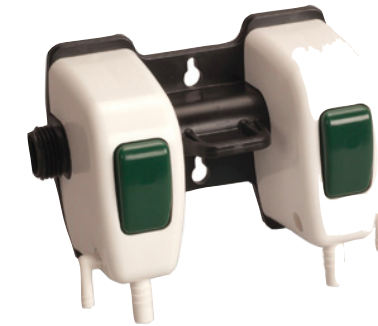
DUAL WALL-MOUNT DISPENSER F699098 Simple and easy to use • Accurate dilution and dispensing • 2gpm flow-rate

1:64 dilution F694728 // 4/64 oz pH 12.0