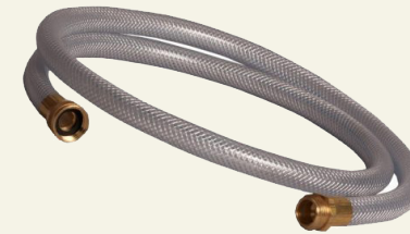
WATER SUPPLY HOSE F697098 5/8 in. x 72 in.