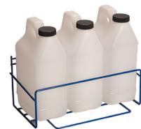
HALF-GALLON F-STYLE RACKS NON-LOCKING Available with one, two, three, or four bottle configuration.